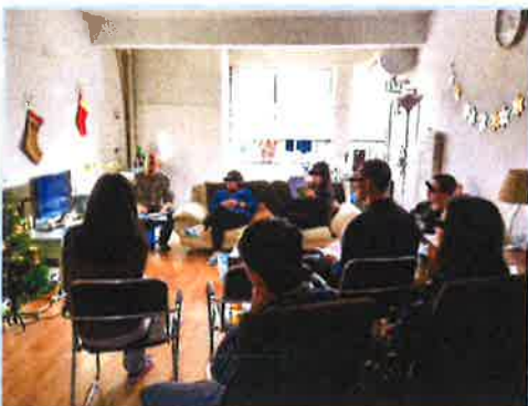
Students at the evangelism training.