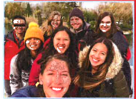
Friends from Arizona exploring the city with us!

"For to us a child is born, to us a son is given, and the government will be on his shoulders. And he will be called Wonderful Counselor, Mighty God, Everlasting Father, Prince of Peace." Isaiah 9:6